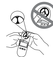
Replacing the Impeller

You may recalibrate the wind speed readings by replacing the impeller. Press FIRMLY on the sides of the black impeller housing with your thumbs to remove the entire assembly. When inserting the new impeller, be sure the arrow is facing the display side of the unit, and is aligned with the top of the meter. Press on the sides of the housing rather than the center.