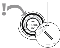
Replacing the Battery

When your display becomes dim or disappears, replace the battery. Use a large coin to open the battery compartment. Use only new CR2032 coin cell batteries (available where watch batteries are sold). Wipe the battery clean of any fingerprints and insert the positive (+) pole up, angling the battery downward and pressing it firmly into place. When replacing the battery door, be sure to keep the black rubber o-ring seated in the groove on the case back.